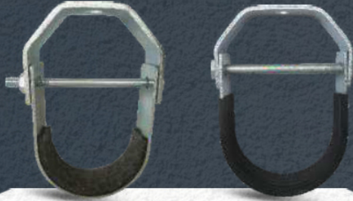
WITH FELT LINING