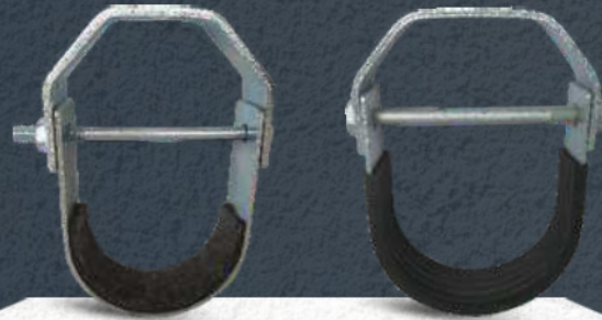
WITH FELT LINING